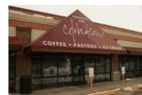
Grounds for Celebration