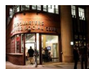
DM Social Club