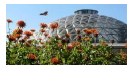
DM Botanical Ctr