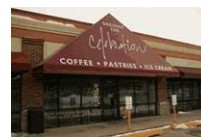
Grounds for Celebration